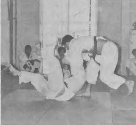
Judo at Estrella Club